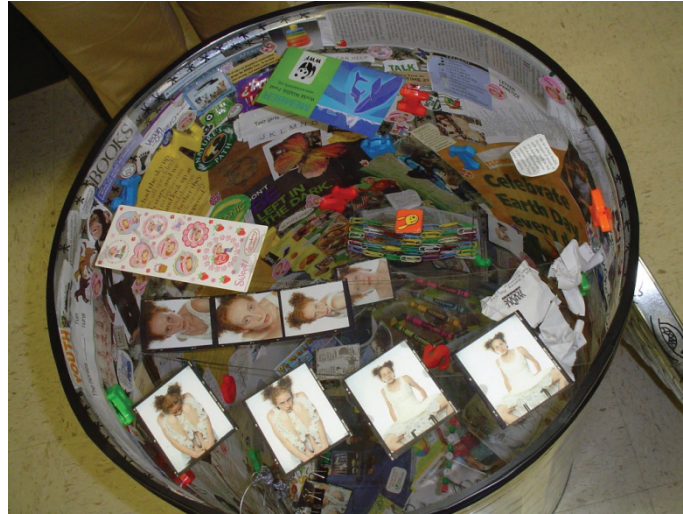
Figure 5. Trashcan by Jaime, Spring 2006.

Whole greater than the parts. Many of the students indicated that a reader is more than a sum of decontextualized literacy skills (e.g., phonemic awareness, decoding, etc.). Therefore, another use of imagery was the idea that many factors come together to ultimately form the whole—ideally a literate being capable of reading both the word and the world (Freire & Macedo, 1998). Margaret’s fudge is an excellent illustration of “reading the word,” because it symbolized the many subsets of literacy skills needed in order to read text. Jaime’s urban sculpture, on the other hand, symbolized not only the experiential but also the socio-cultural, -political, and -historical factors that impact a reader’s ability to “read the world.”