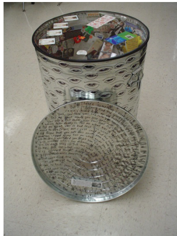
Figure 4. Trashcan by Jaime, Spring 2006.

From our perspective, the lighter image contains colorful, moving characters that leap from the pages of the book and engage with the surroundings as the older reader brings them to life through comprehension. In the darker image, however, the characters from the book are almost see-through and less animated, because the young reader’s comprehension level keeps him somewhat “in the dark.”