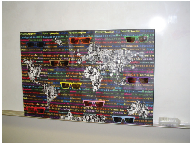
Figure 7. The View Through My Eyes by Cassandra, Spring 2006.

plastic sunglasses to the canvas to represent “different colored lenses... [because] everybody sees the world differently.” She added, “The color of my lens is not the same as the person next to me” (interview 12/06). In tying her representation to reading comprehension, she went on to emphasize the importance of including, fostering, and validating multiple perspectives in the classroom in order to enrich the prior knowledge, experiences, and values of our diverse student population. For example, teachers should incorporate literature representing diverse perspectives for activities and their classroom libraries. As illustrated with the many colors of sunglasses, teachers should also be aware that backgrounds and experiences may shade interpretations differently even though a single piece of literature is being discussed.