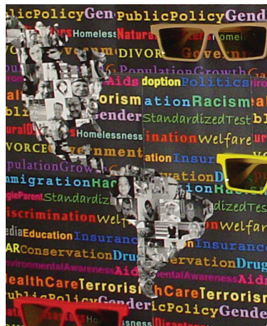
Figure 6. The View Through My Eyes (detail) by Cassandra, Spring 2006.

Cassandra’s first aesthetic representation, entitled “The View Through My Eyes,” (see Figures 6 and 7) consisted of “like the world map, but instead of the world map it was pictures of people cut out” (interview, 12/06). She made the bodies of water with “a background of words that impacted a lot of students...words that are powerful...like divorce , war , poverty ...” (interview, 12/06). In addition to the meticulously cut-out continents of black-and-white photographs and the sea of words that she designed on her computer, Cassandra adhered various multi-colored