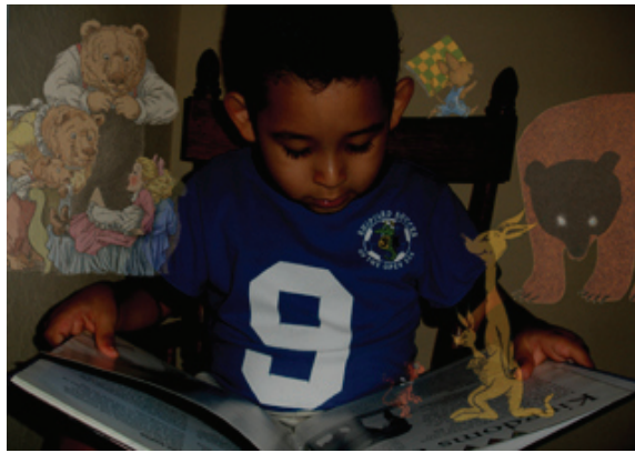
Figure 2. My Wonderland Come to Life (Part 1) by Estela, Spring 2006.

Darkness to light. Estela was able to use the vivid imagery of darkness and light to parallel the level of comprehension experienced by early and experienced readers. Estela had another way of using imagery to convey the transformative nature of literacy acquisition. During the Spring semester, Estela’s aesthetic representation was comprised of two photographs (see Figures 2 and 3) that she took of her young nephew with a book and her sister reading a novel. After she took the photo-