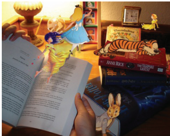
Figure 3. My Wonderland Come to Life (Part 2) by Estela, Spring 2006.