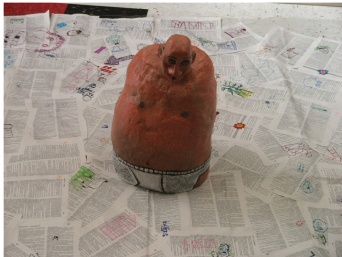
Figure 9. Dictionary drawings with Blank man by Jamie, Fall 2006

For her second aesthetic representation (see Figure 9), a clay figure of a man stood in the center and on top of a scattered clutter of ripped-out