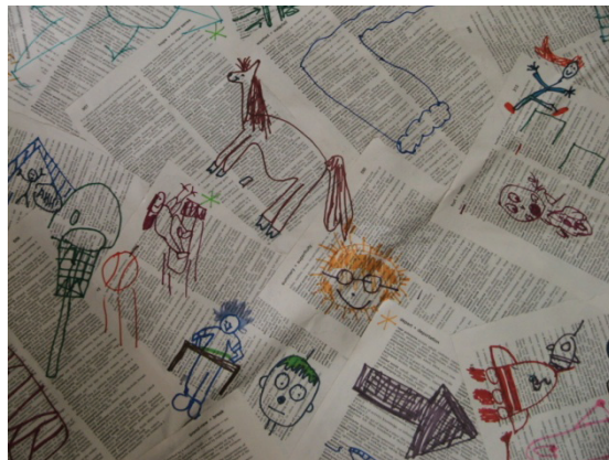
Figure 10. Dictionary drawings (detail) by Jamie, Fall 2006.

Cuero: That everyone wanted to buy from you. Everyone was like, "How much?"