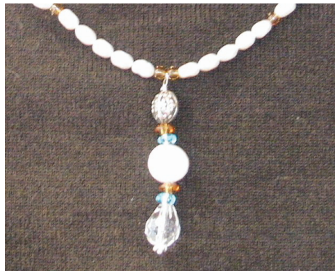
Figure 1. Jewelry by Leticia, Fall 2006.

All six teachers used imagery in their twelve aesthetic representations in their pursuit to capture the intricate and complex nature of the literacy process. Here we describe three diverse uses of imagery that touched upon the transformational and multi-dimensional aspects of literacy learning: (a) opaque to transparent, (2) darkness to light, and (3) whole greater than the parts.